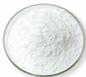
E.D.T.A. Tetrasodium Salt